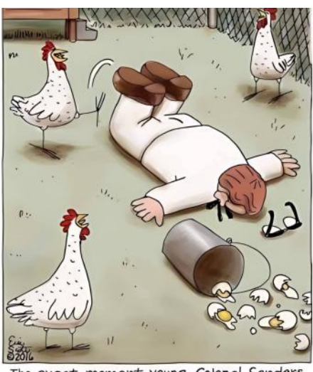
The exact moment young Colonel Sanders conceived his secret recipe for fried chicken.