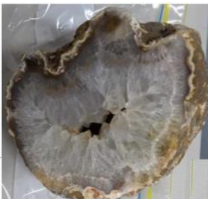
001 Agate Geode Polished face

3pm Lapidary and faceting equipment and faceting rough for sale