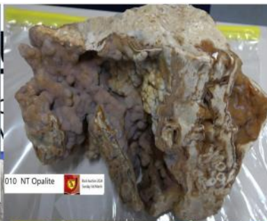
010 NT Opalite