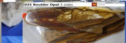
035 Boulder Opal 3 slabs