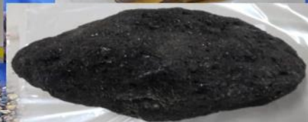
104. Tourmaline Specimen large