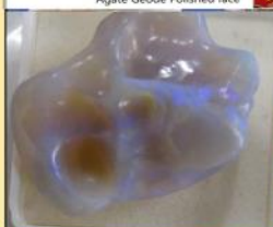
012 Skin Polished Opal