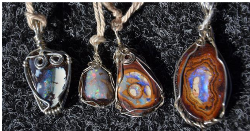
Yowah Nut jewellery. Sterling Silver Wire wrapping done by Ellie Wilson