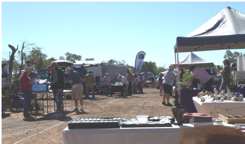
Yowah Opal Festival