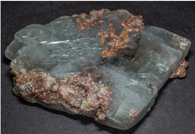
Baryte & Dolomite - BaSO 4

Moved: Blue Mountain Seconded: Parramatta/Holroyd that General Business be accepted.