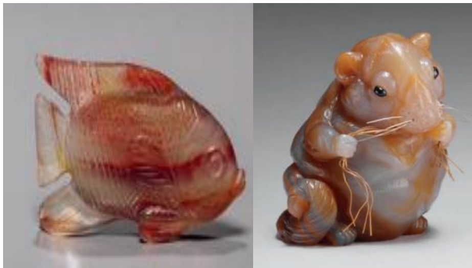
Beautiful Agate Animals