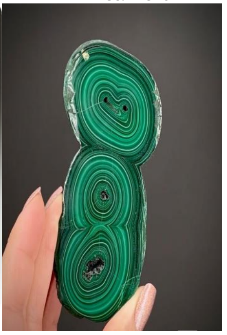
A slice of a Malachite stalactite