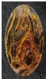
Tiger eye from the Brockman Formation.