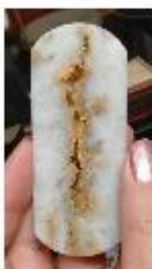
'Golden dragon' native gold in quartz.