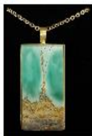
Variscite Set in 23ct native (nugget) gold.