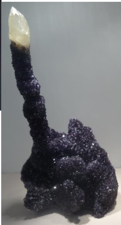
Amethyst on Calcite