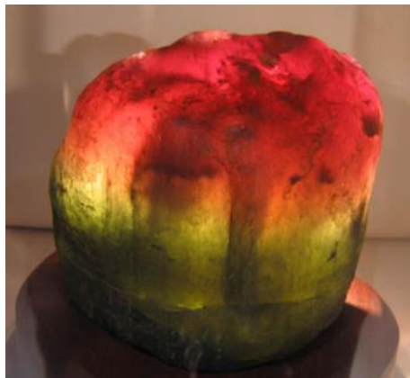
Rare Multi Coloured Nigerian Tourmaline