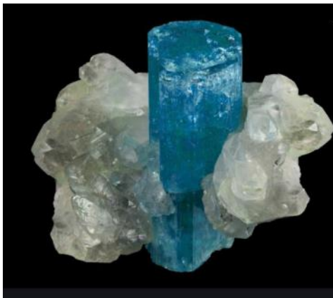
Aquamarine in Calcite