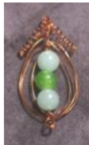
Copper wire work by Lismore Club's Junior Rockhounds

Lismore Lapidary Club have their ever-popular annual GEMFEST coming up from 19-20th May, with the Club newsletter stating it is 'the biggest lapidary show in the country'. Gemfest is the Club's major annual fundraiser, and all members, particularly new members, are encouraged to help. The Club reports recent successful field trips to Green Pigeon and Eureka. The next field trip is to Emmaville for the Easter break, with visits to