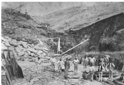
Martin's slate quarry at Willunga

From the 1850s to 1900s, Willunga was the roofing slate capital of Australia and had five quarries operating. According to the GEMBOREE booklet, 'Willunga Slate has been used extensively throughout the town for drains, bridges, tombstones, seats, pavement, roofing and flooring, and when sealed together made excellent rainwater tanks. Slate was also used for buildings all over Australia including a Perth cathedral, Melbourne's GPO and the Adelaide Town Hall. Many Cornishmen were employed for their mining and quarrying talents. The cutting, splitting, chiselling and shaping were all done by hand and there is a marvellous collection of tools on display' (GEMBOREE 2018 booklet).