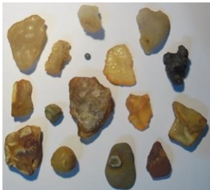
Lismore Club's field trip yielded a good variety of chalcedony, as well as jasper and carnelian

Lismore Lapidary Club's recent field trip to Eureka was well-attended, included two keen visitors from Gatton Club in Queensland. After a lovely day searching for chalcedony and jasper in the wash sections of Coopers Creek, everyone went home satisfied with some nice finds.