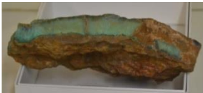
Winning entries for Artefact of the Year (top), and Purchase of the Year