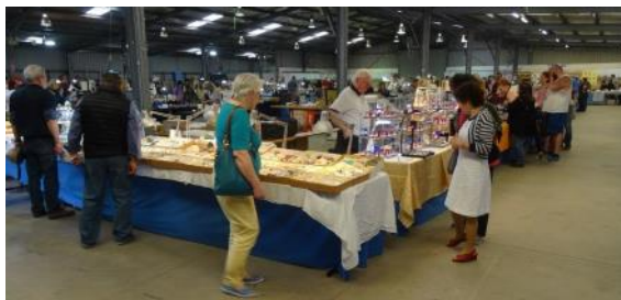
GEMKHANA 2017

together to Rubyvale where we were to spend a few days making our fortune, digging for sapphires. The fortune bit did not eventuate, so I am still on a pension. ♦