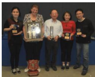
Northern Districts Lapidary Club members sporting their trophies won at GEMKHANA, including Champion Club (highest point score)

The competition section attracted 182 entries [the same as last year]. Congratulations go to the Northern Districts Lapidary Club [NDLC], which was awarded the trophy for