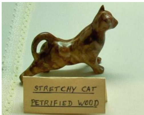
Carving from GEMBOREE 2015