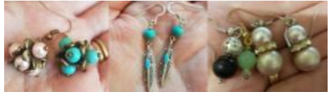
Last month Campbelltown Club ran an earring-making workshop

Campbelltown Lapidary Club issue a general reminder to all members who use the workshop that 'it is really important to look after the equipment. It is expensive and if used incorrectly or not cleaned up after use, can be damaged and rendered unusable. Wash your hands and your stones thoroughly before moving to the next wheel (don't just dunk them quickly under the tap). Clean your machine after use. If something breaks or isn't working properly, report it immediately to the duty officer.' The Club's next field trip is to Lightning Ridge in October. Members are reminded that Membership fees are due.