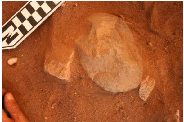
Edge-ground hatchet head being excavated

(Info & images from: https://www.theguardian.com/australia-news/2017/jul/19/dig-finds-evidence-of-aboriginal-habitation-up-to-80000-years-ago?CMP=soc_567 & https://theconversation.com/buried-tools-and-pigments-tell-a-new-history-of-humans-in-australia-for-65-000-years-81021?m_source=facebook&utm_medium=facebookbutton )