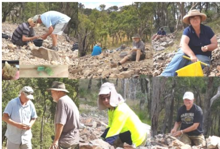
Campbelltown Club members had a week-long field trip to the New England district

crystal found near Tingha, and some rutile quartz found at Tingha Sands along with a surprise of olivine crystals on some basalt. Visits to Billabong Blue & Seven Oaks yielded some sapphire, and a trip to Emmaville Mineral Museum was followed by plans for a tour of the Emmaville tin mine where they searched the tailings