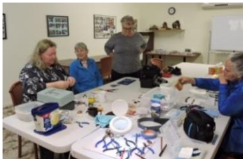
Club members at Ellie's wire-wrapping course

Canberra Lapidary Club regularly hold interactive social meetings, with their last one featuring a fun exercise examining and identifying 20 minerals and 5 rocks. According to the newsletter, "Members spilt up into groups and put their collective heads together to come up with the answer. The use of reference books and any scientific equipment (for example, magnifying glass, magnet, etc) are permitted. This format