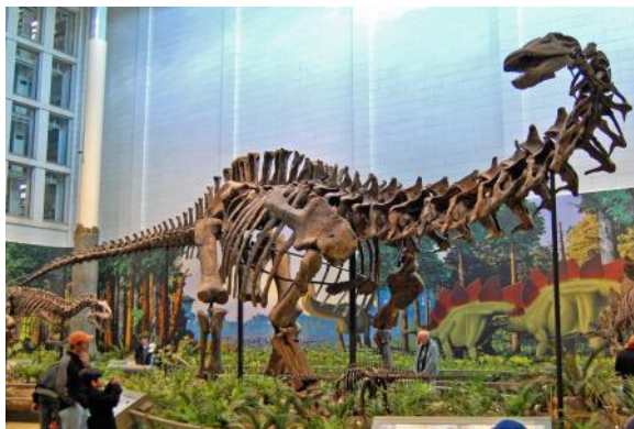
Apatosaurus louisae , Carnegie Museum