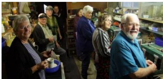
All hands on deck for Casino Club members

The Casino Lapidary Club reported very busy Saturday workshops, with