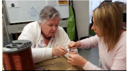
The Campbelltown Club recently held a Viking knitting workshop

an anniversary dinner being planned for later in the year. The May workshop on Viking knitting was an inspiration. Seventeen new members have been welcomed to the Club. All members are reminded that membership fees are due on July 1st.