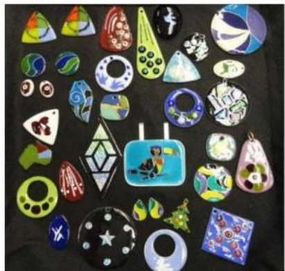
Enamelling work from a workshop run by the Northern Districts Club