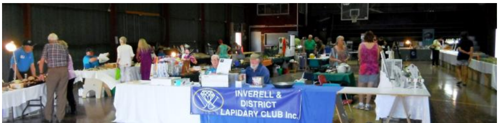
The traders pavilion at the Inverell & District's Gem & Craft Show in October.