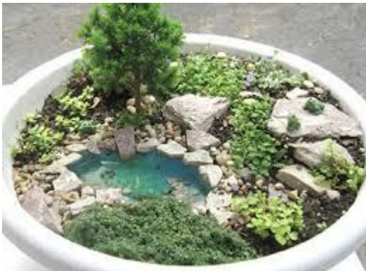
Miniature Garden Designs