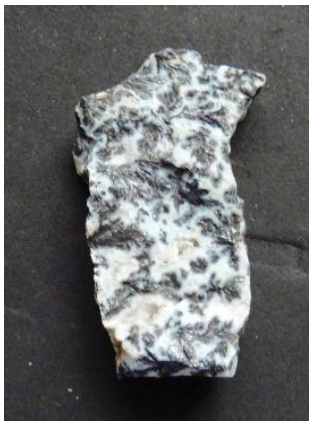
Club Specimen – dendritic manganese oxide in white chalcedony.

So, the club specimen is a dendritic manganese oxide in a white chalcedony (photo attached) (As usual we do not know the source location of the material :-)