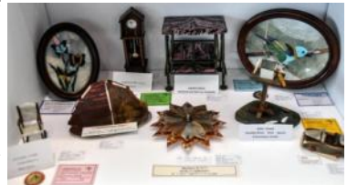
Some of the award-winning entries from GEMBOREE 2016