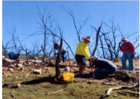
Inverell Club members fossicking Copeton Dam

Inverell & District Lapidary Club have their annual Gem & Craft Show coming up from Friday the 14 till Friday 21st October at various locations around Inverell. The Show opens at the Inverell Pioneer Village, and features fossicking excursions, demonstrations, traders, tailgaters, and a mystery tour.