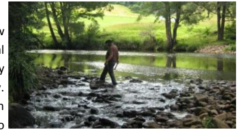
Canberra Club field trip to Kangaroo Valley

The Canberra Lapidary Club are now holding 'show & tell' at their social meetings, giving members an opportunity to share their love of all things lapidary. The Club have had a busy few months, with ten members enjoying the Club field trip to