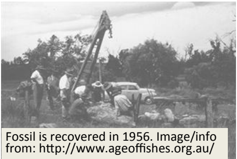
Fossil is recovered in 1956. Image/info from: http://www.ageoffishes.org.au/

Information from http://www.prehistoric-wildlife.com/species/m/mandageria.html , https://en.wikipedia.org/wiki/Devonian & http://www.abc.net.au/news