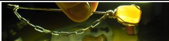
Hand-shaped wire-wrapped fire opal pin brooch with soldered chain links made by the Editor

Keep in mind that material sold at the free tailgating stall MUST be Club material - that is, it is not to be owned by an individual. It is aimed to benefit the Club as a whole.