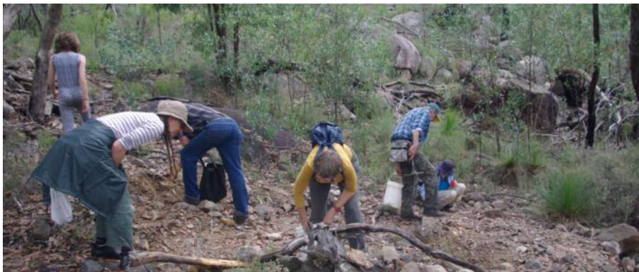
Members of the Lismore Club speccking at Emmaville (from May Club Newsletter)

Please forward all details of elected officers to the G&L Council Secretary following your local Club AGMs. Also, if your Club has a webpage or a facebook page, make sure you inform the G&L Secretary to ensure that the NSW G&L Club Index page is current.